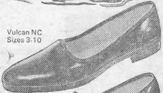
Vulcan NC Sizes 3-10

Drizzle or downpour, Bata weather-proof shoes will stand you in exceptionally good stead—they keep your feet dry and clean. Just a flick of cloth, the shoes too become dry and clean! Bata weather-proof styles—a cosy blending of sleek lines and sturdy material.