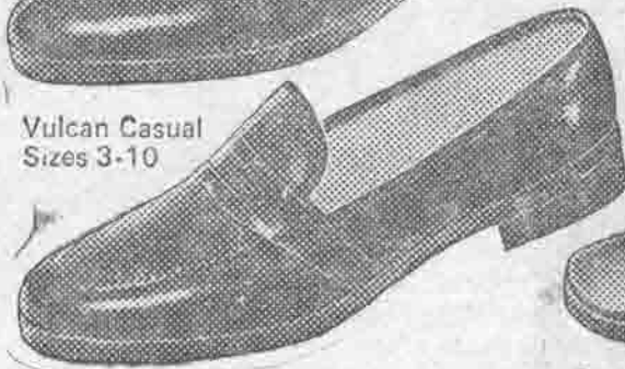
Vulcan Casual Sizes 3-10