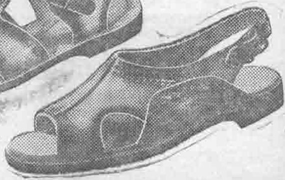
Sure Step - Microlon Sizes 4-10